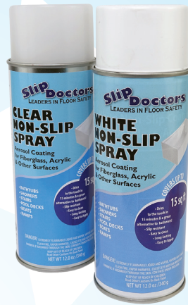
Available in Clear and White!

Note: for porcelain bathtubs, please repair any chips prior to application. Repair kits can be purchased at your local home improvement store.